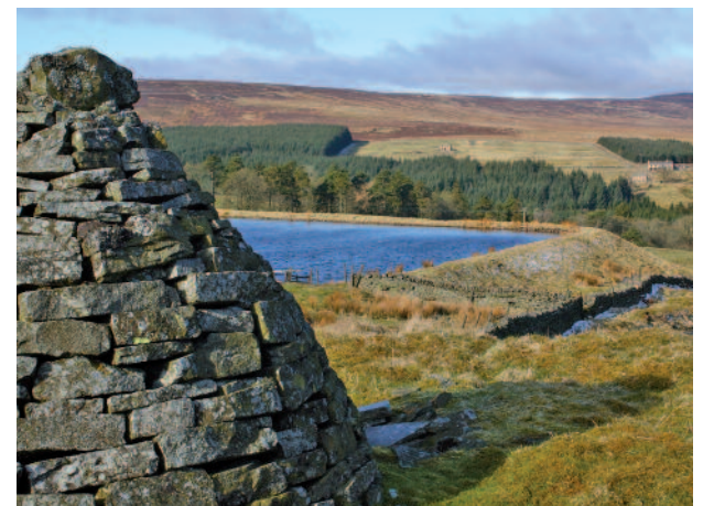
Capped mine shaft and reservoir east of Allenheads

The mine workings are mostly hidden underground, but in the village you can still see the old washing floor, shafts and mine buildings. The surrounding hillsides are also covered with evidence of the area's lead mining past – as you'll discover on this walk.