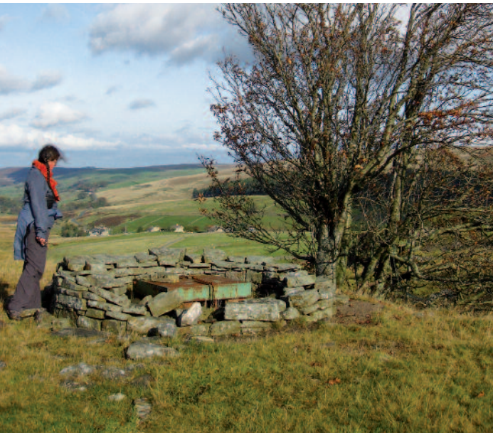
A capped mine shaft west of Allenheads

Front cover: Miners' farmstead west of Allenheads